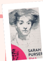
Commemorative Stamp, issued 2020